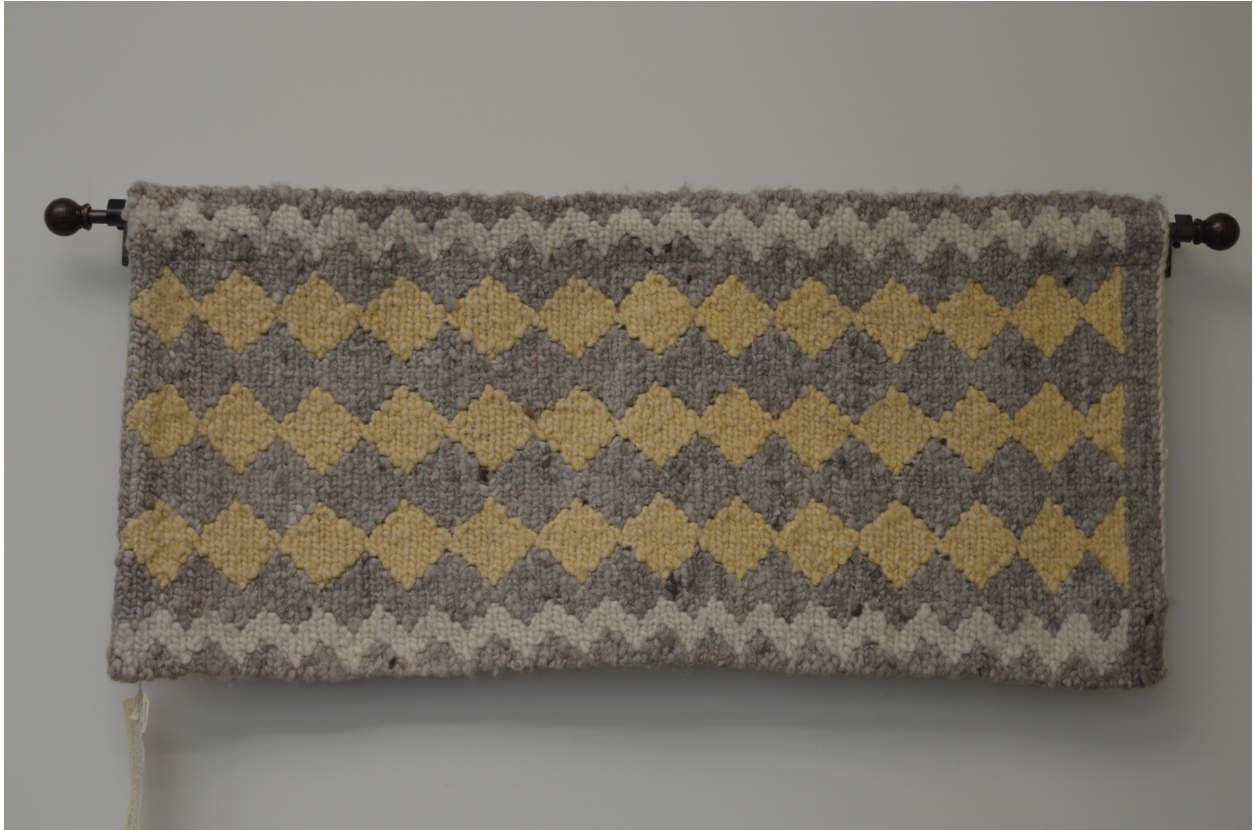
Coast Salish Weaving - Sample 2